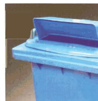
Recycling Lid option for MGB240L