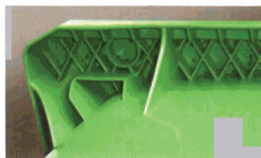
Deeper combs ensure optimum accommodation on the lifting device