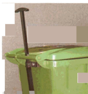
Extended Handle option for MGB60L