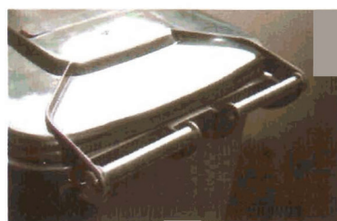
Twin Handle option