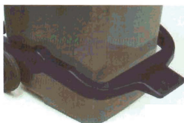
Plastic Foot Pedal Available for 60/80/120/240